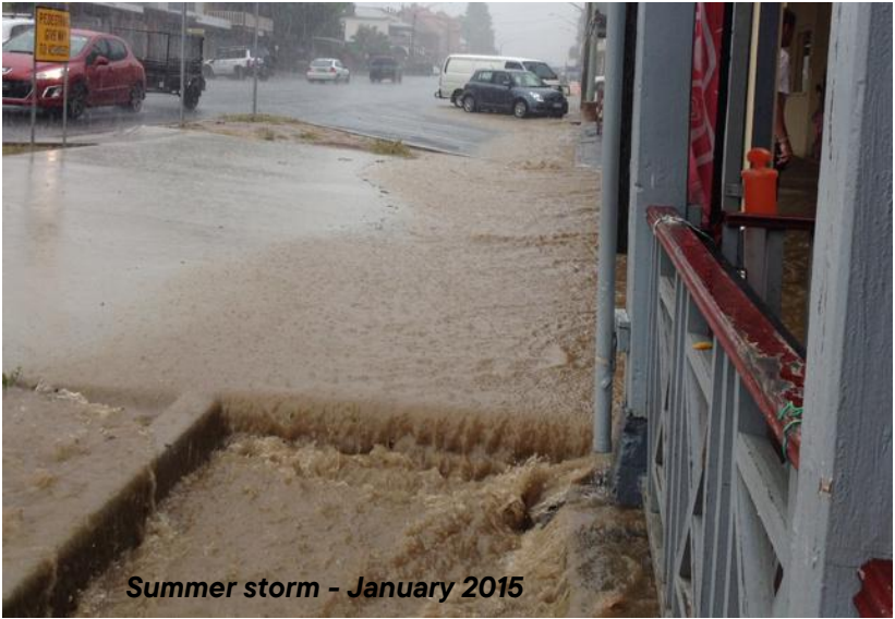
Summer storm - January 2015

Queanbeyan-Palerang Regional Council has engaged consultants for a Major Overland Flow Investigation in Braidwood. We are seeking community feedback in the form of photos, diagrams, sketches and/or descriptions of drainage and flooding patterns. The information will be used to inform the flood models that will be developed as part of the investigation. Complete the form to provide information and photos at bit.ly/Bwd-Overland-Water The purpose of the investigation is to understand the major overland flow flooding that happens when there is heavy rainfall over parts of the Braidwood township. It will also look at options to reduce the impact this has on the community. The investigation will build on the results of the Braidwood Floodplain Risk Management Study and Plan (completed in 2019). This study showed there were several significant major overland flow paths in the urban parts of Braidwood. The most noticeable is along Wallace Street during intense rainfall events. The Braidwood Floodplain Risk Management Study and Plan recommended Council undertake a more detailed assessment to look at major overland flows in Braidwood. Provide information by completing the form at bit.ly/Bwd-Overland-Water or by email to floodplain@qprc.nsw.gov.au by Friday 9 August. This project received grant funding from the Australian Government.