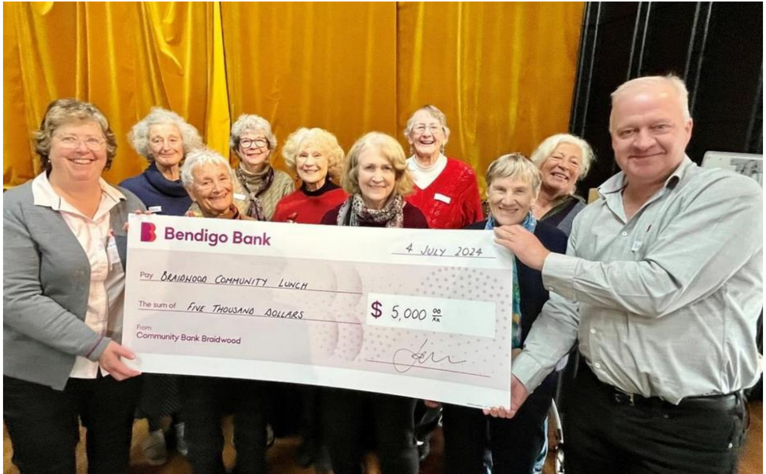
The popular First Thursday Community Lunch Group at Braidwood Servicemen's Club has received a donation of $5,000 from the Community Bank.