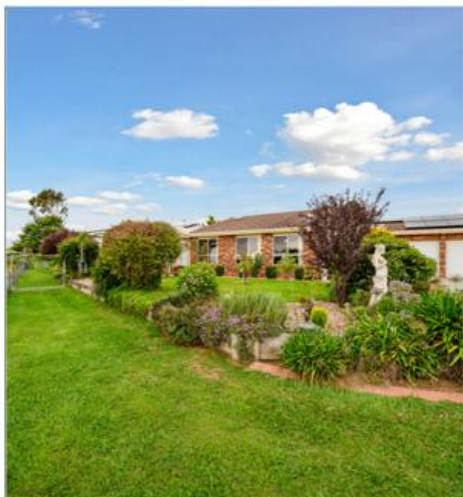
161 Majors Creek Road 4 Beds 2 Bath 2 Car Spectacular Views over Braidwood Motivated Seller Open to Offers!

Under the new laws, individuals selling non-therapeutic vapes may risk up to seven years in jail and $2.2m in fines. Corporations can be made to pay up to $21.91m per contravention.