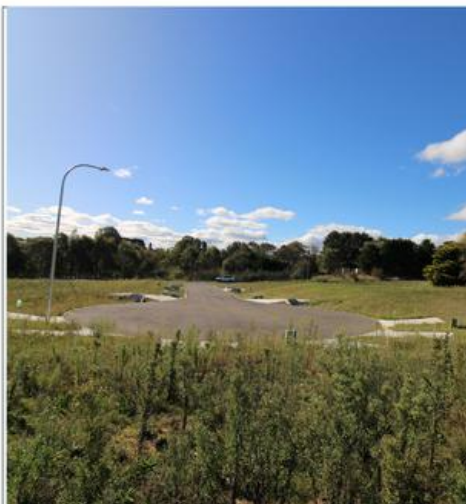
Maddrell Place 4 residential blocks Build your dream home in the Braidwood township For sale $345,000