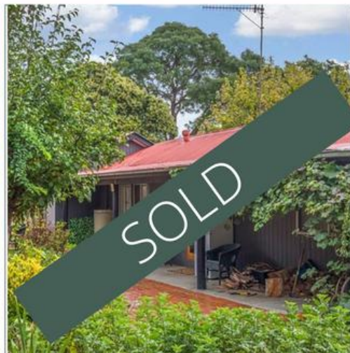
80 Ryrie Street 3 Beds 2 Bath 1 Car The Garden Cottage PLUS Studio Sold $625,000