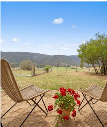
5976 Araluen Road Araluen 3 Bed 1 Bath 6 Cars Solar Passive Home in the Valley For sale $799,000