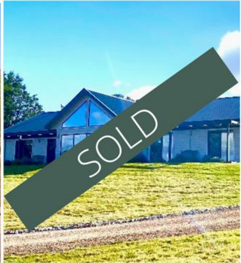
20 Narranghi Road, Braidwood 3 Beds 2 Baths 2 Garages Beautiful Country Home with Views SOLD off Market