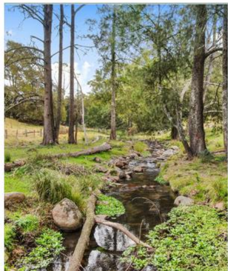
Lot 1 Neringla Road Araluen 190 Acres /76.9 HA approx. Adventure awaits with Tiny Home For sale $595,000

QPRC is in a risky financial situation and is using our wallets to underwrite its poor choices and decision making. Electing, below-the-line, me and others with similar commitments will help reverse and repair that wrong. Please review my election website for fuller information about my background, the issues that need fixing, and what I pledge to achieve for you.